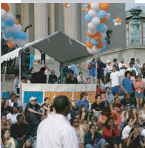
The KSA Block Party brought together over ten student groups for a day of outdoor fun.

The KSA and the Black Students Organization had its first ever SeOUL Food in February.